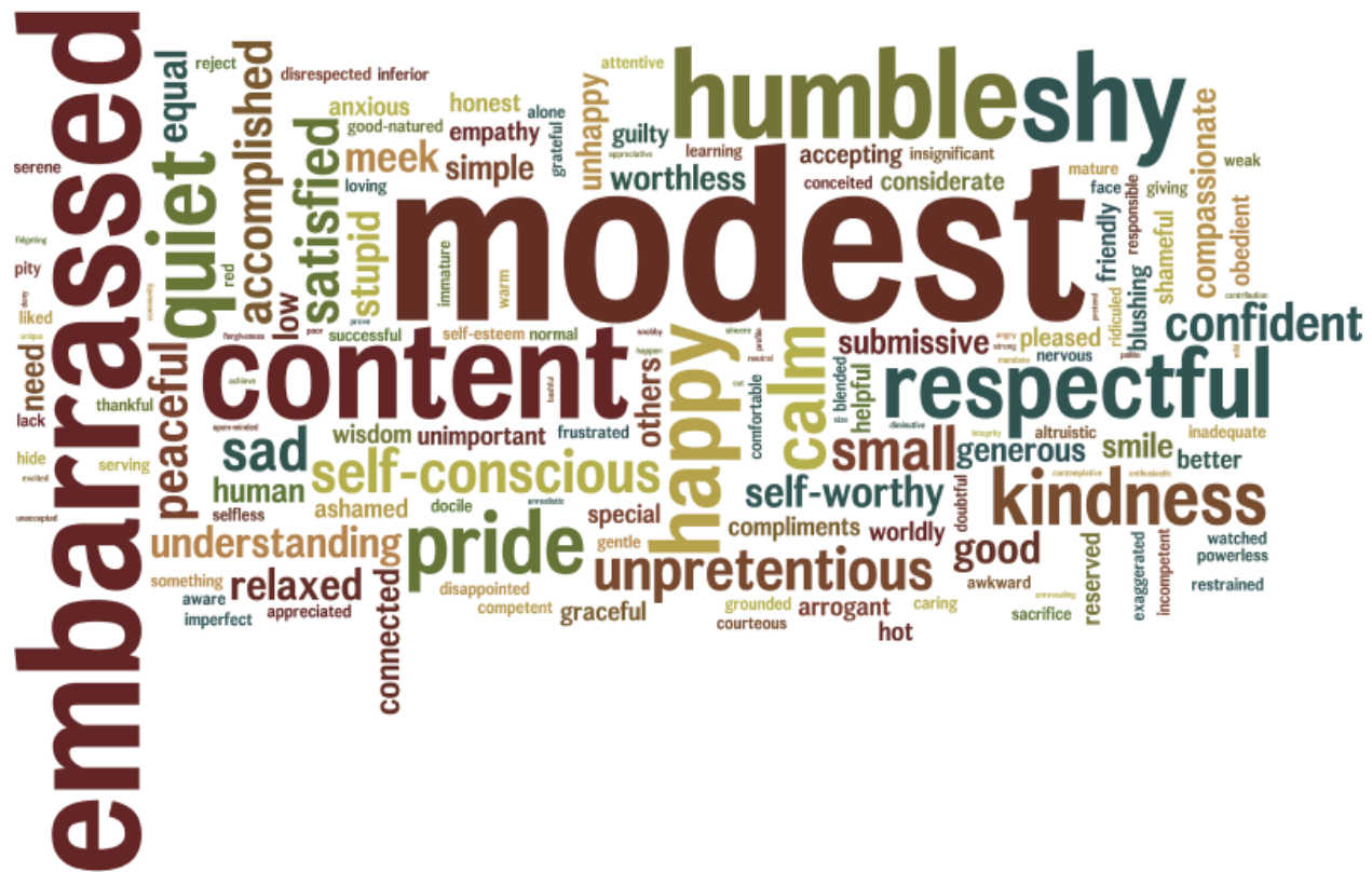
Figure 1. Word cloud depicting humility-related words generated by lay persons (Study 1)

Note: n = 308 unique words. Word size indicates frequency of being mentioned.