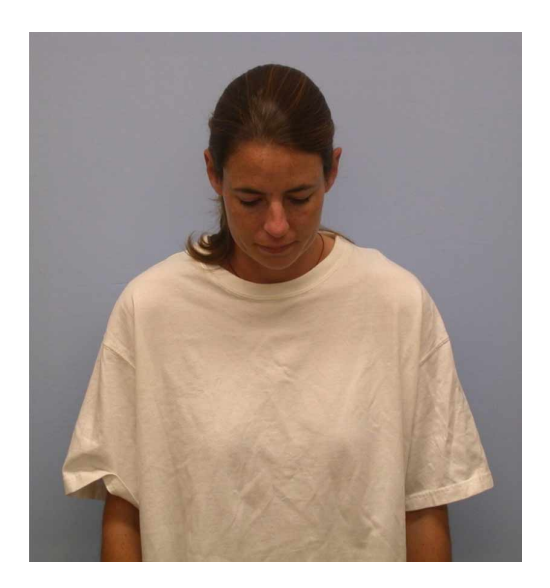
Figure 2. Prototypical shame expression (reprinted from Tracy, Robins, & Schriber, 2009).

unlikely to have learned about the pride expression from cross-cultural transmission (in both groups participants had never left the local community, and had no access to any kind of media—such as magazines, films, or television—from beyond their community), these findings suggest that pride recognition is likely to be universal. Also, like basic emotions, pride can be distinguished from other emotions quickly and efficiently, from a single snapshot image (Tracy & Robins, 2008a), and children acquire the ability to recognise pride at the same age (4 years old) at which they demonstrate accurate recognition (i.e., verbal labelling) for most other expressions (Tracy, Robins, & Lagattuta, 2005).