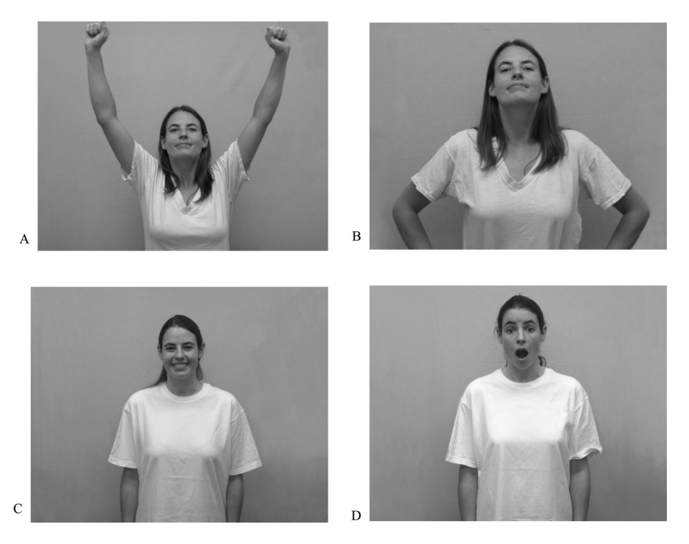
Figure 1. Examples of stimuli used in the present research. Expressions A and B represent the two versions of the pride expression, Expression C represents the happiness expression, and Expression D represents the surprise expression.

chance (i.e., 33%) according to the binomial test (p < .05). Pride recognition did not vary as a function of participant gender, target gender (i.e., gender of the poser), or version of the pride expression (i.e., arms up vs. hands on hips). Nor did we find a Participant Gender × Target Gender interaction on pride recognition. When pride was not identified correctly, it was confused with happiness 76% of the time and surprise 24% of the time. This ratio (76:24) was similar for both versions of the pride expression and for both male and female targets, and happiness was the most frequent error at every age level.<sup>6</sup> Pride recognition rates did not differ when the nonstandard versus standard surprise expression was included as a distractor (57% vs. 61%, respectively). However, children were