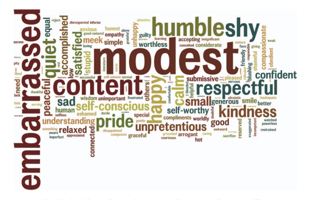
Figure 1. Word cloud depicting humility-related words generated by lay persons (Study 1). n = 308 unique words. Word size indicates frequency of being mentioned. See the online article for the color version of this figure.

with our expectations, humility-related words are semantically organized into two clusters.